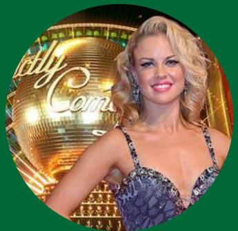
Joanne Clifton TV Presenter