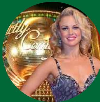
Joanne Clifton TV Presenter